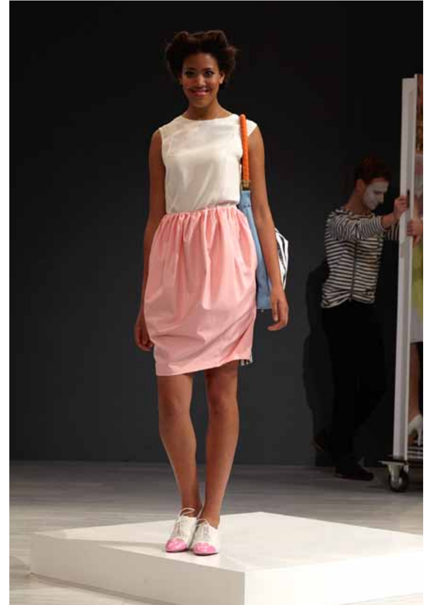
13 MÄUSCHEN BONBON NE b