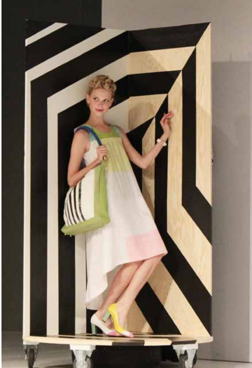
2 BEFORE NINE NE b