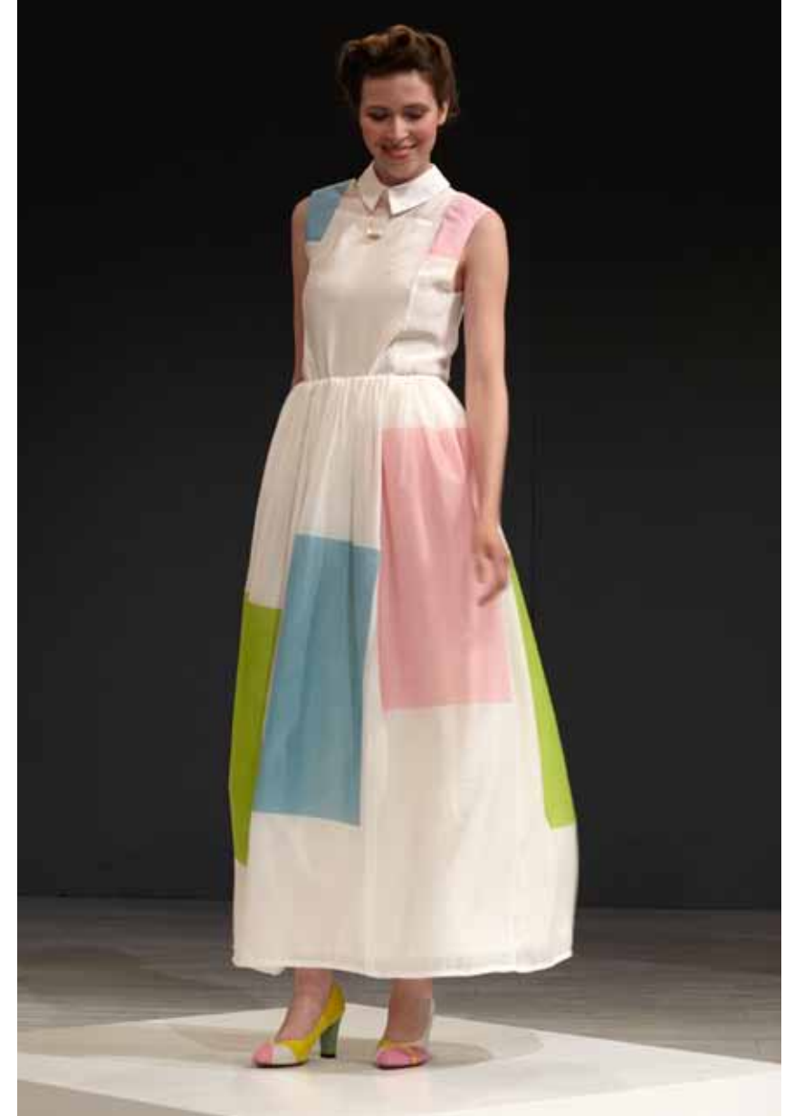
10 BRAUSE MARSCHMELLOW