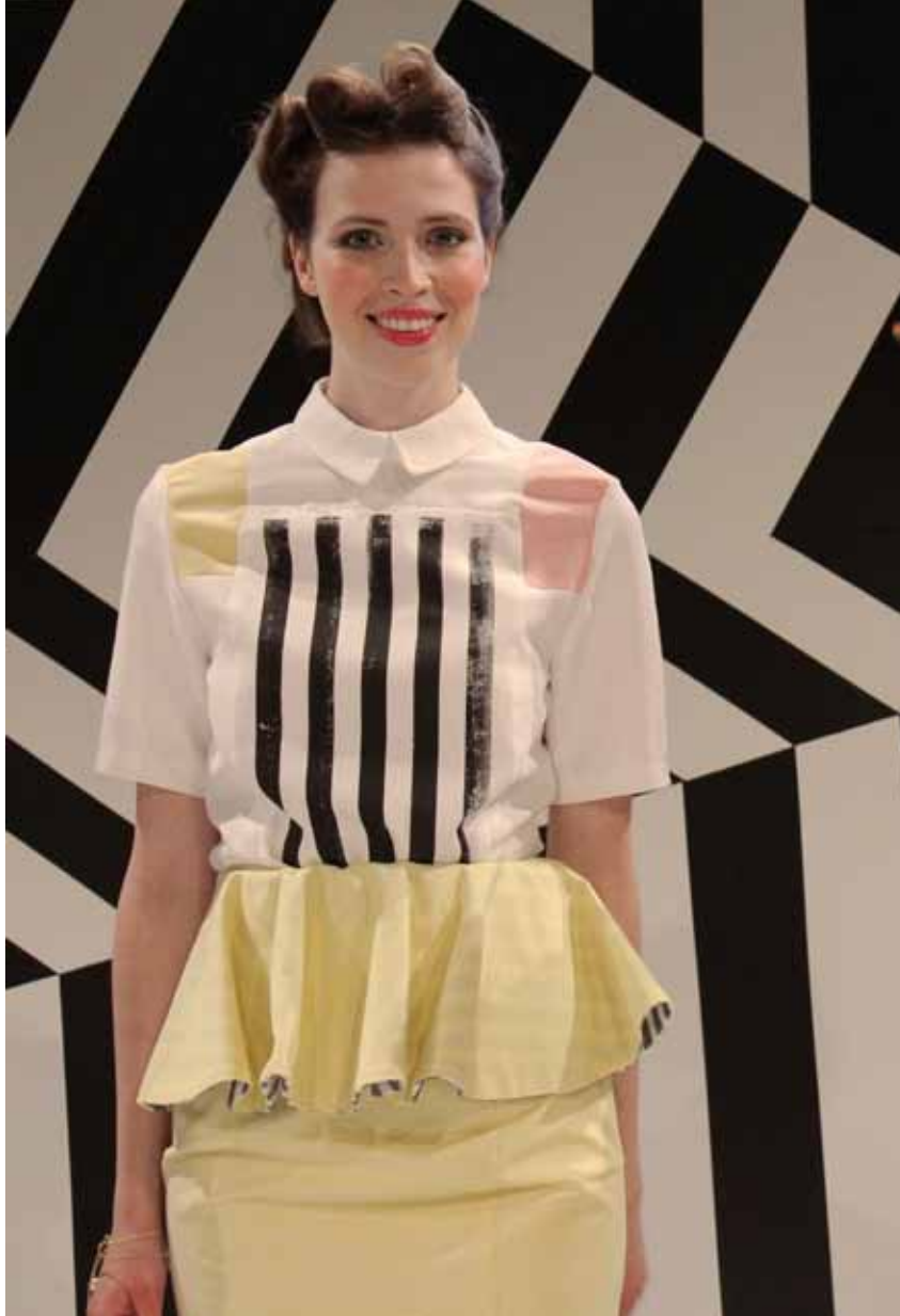
6 TICKTICK SWINGING TOFFI