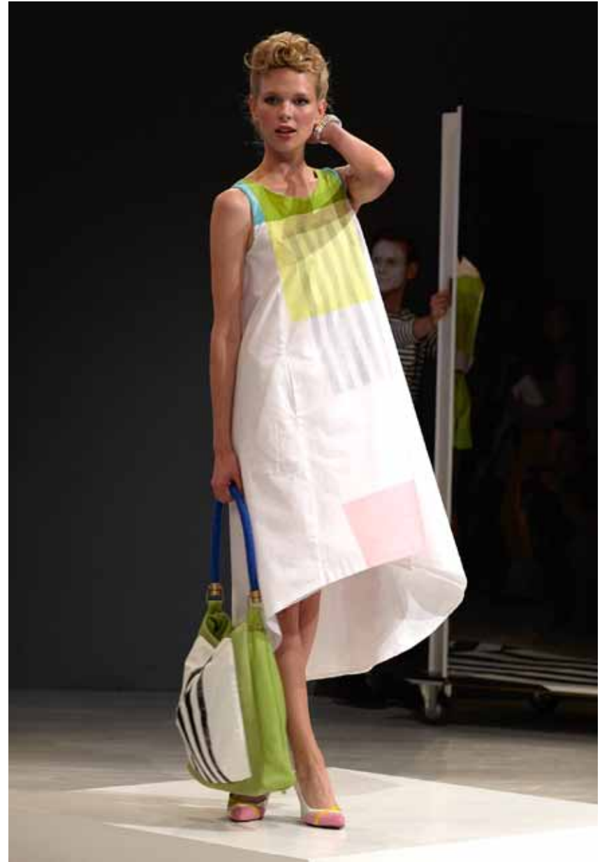
2 BEFORE NINE NE b