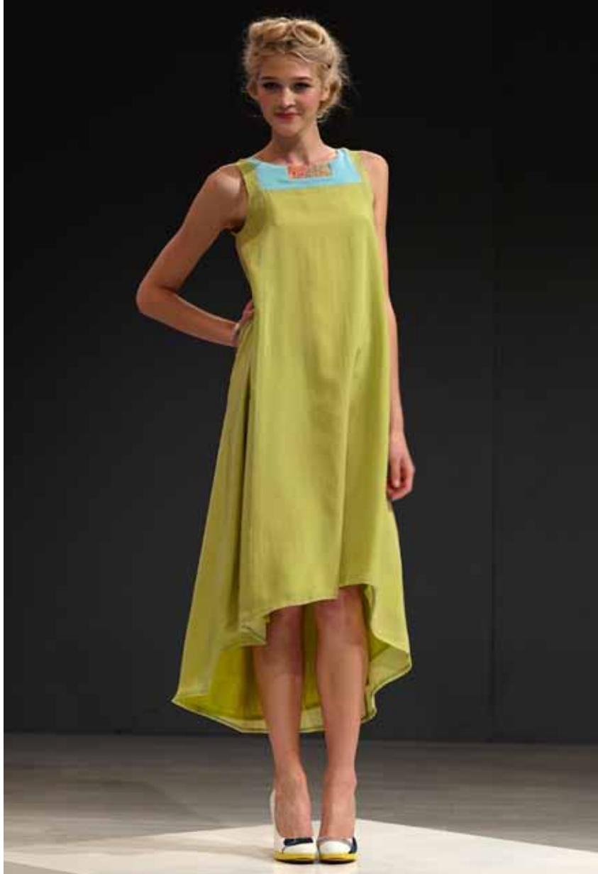
17 AFTER NINE