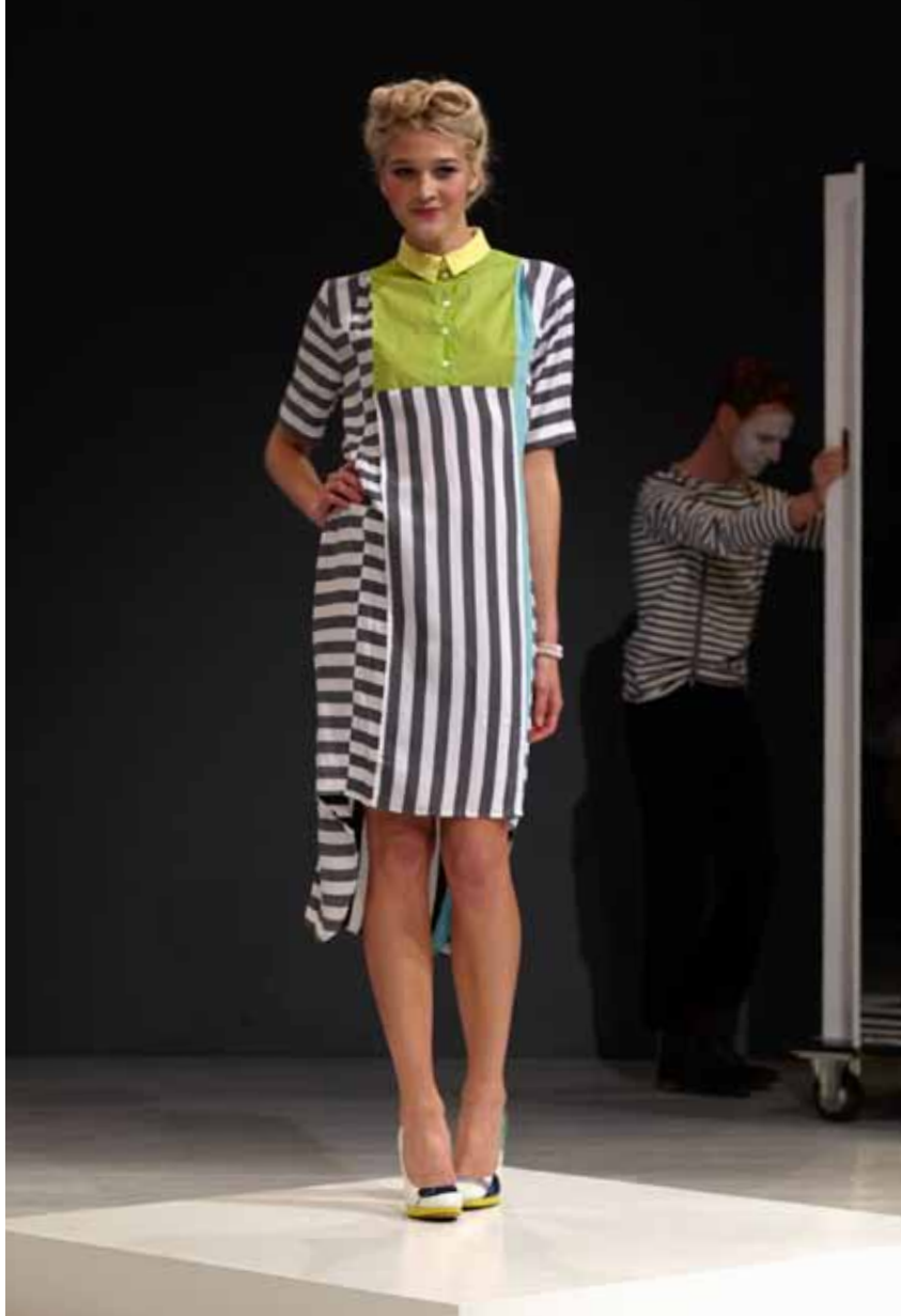
5 SALZIGER HERING