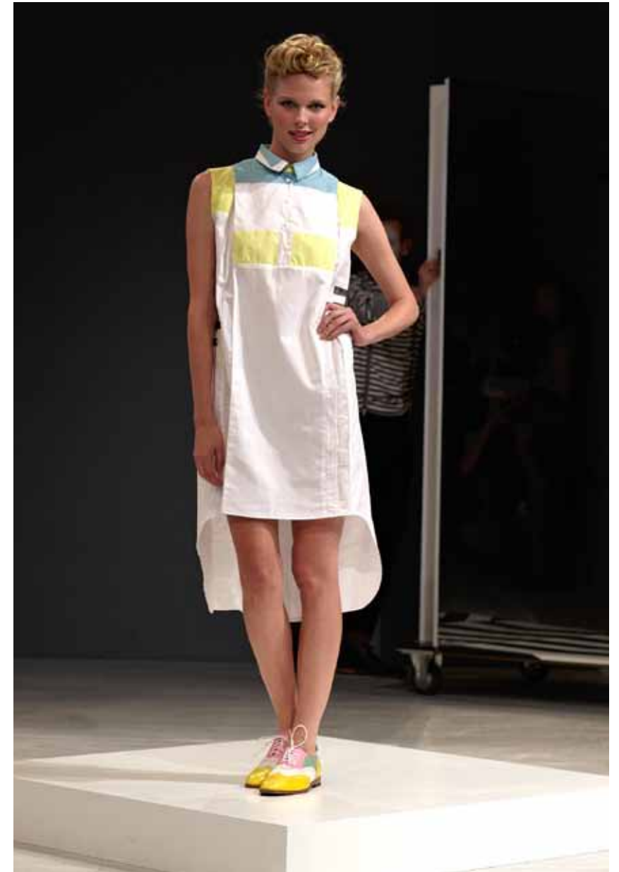
14 WEISSER HERING