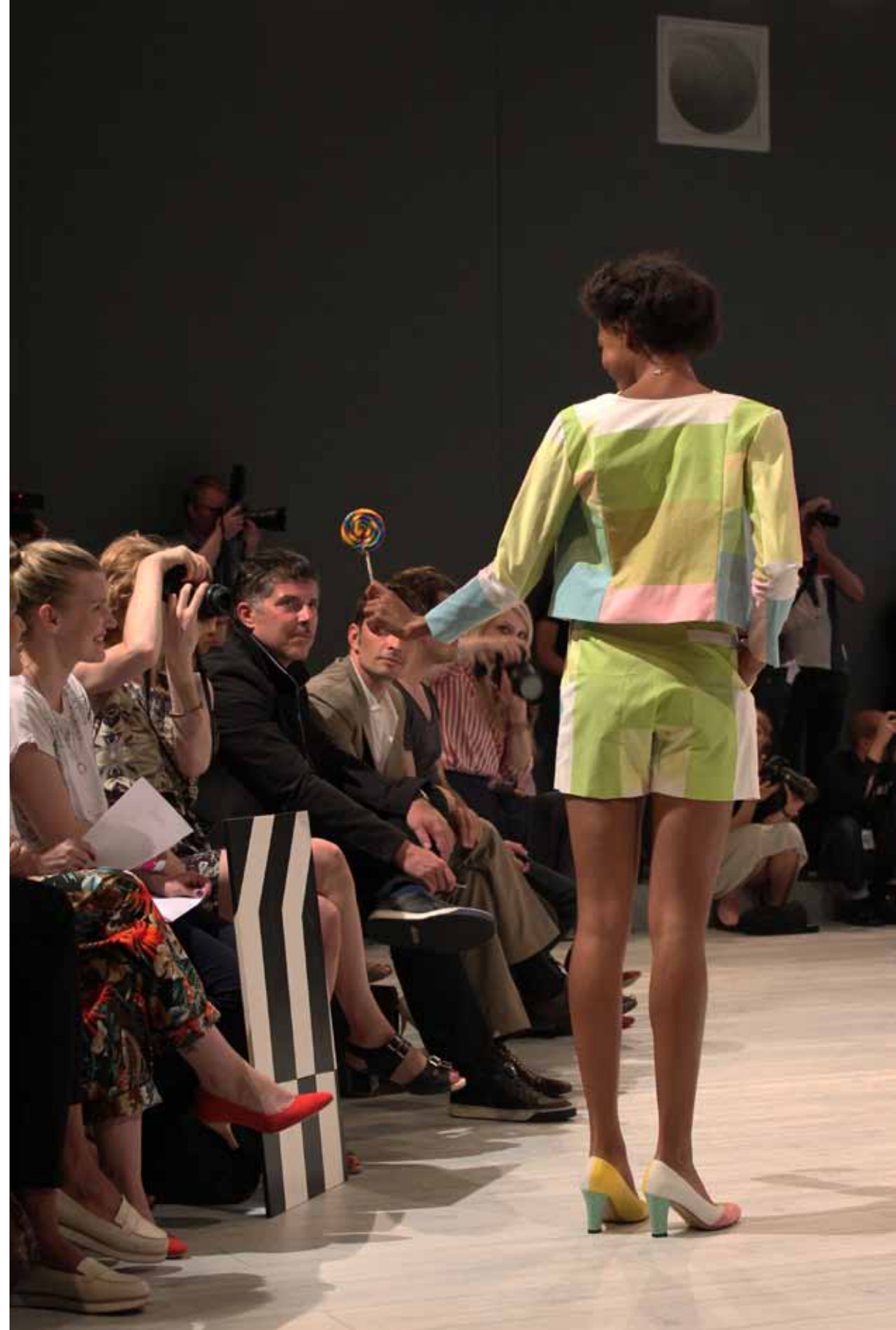
18 HUBBA MÄUSCHEN BUBBA CANDY