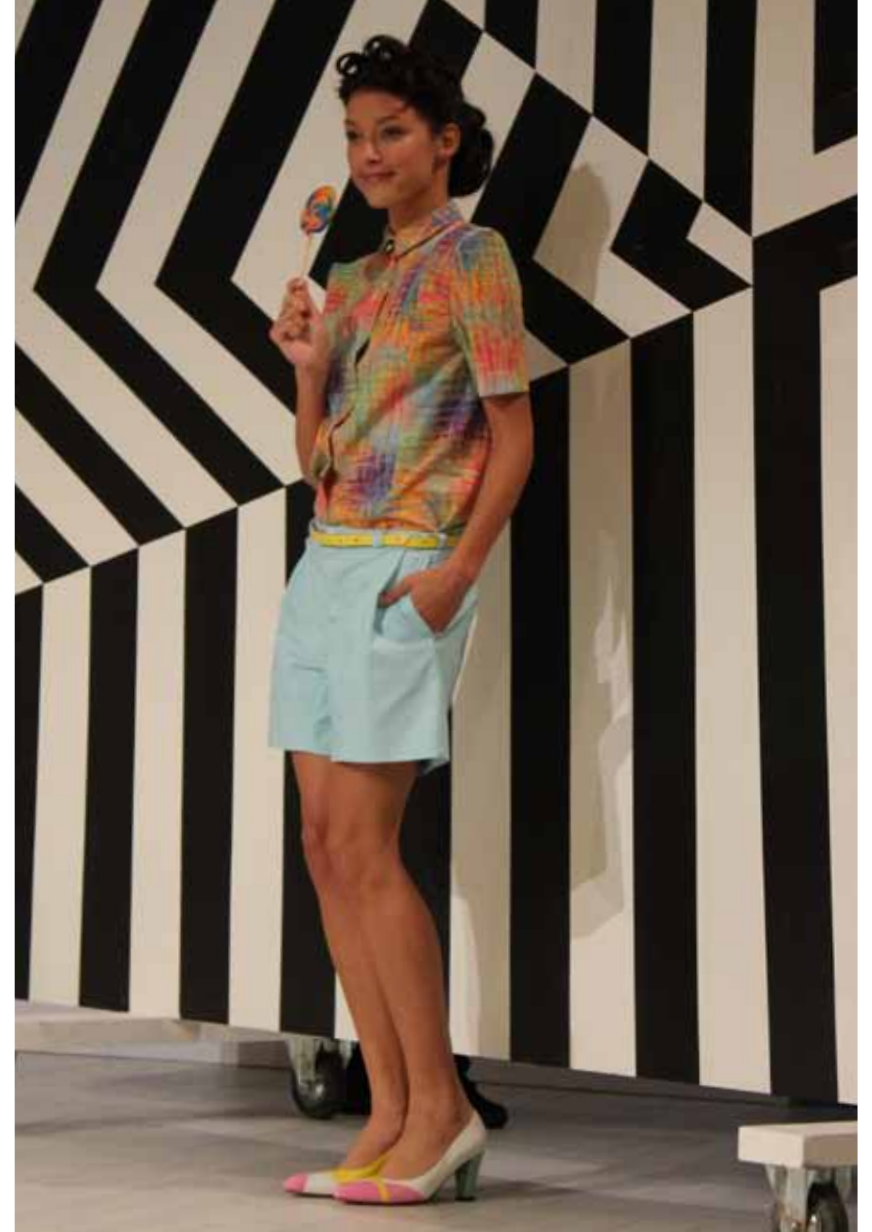
4 ZENTER SHOCK BUBBA BLUE