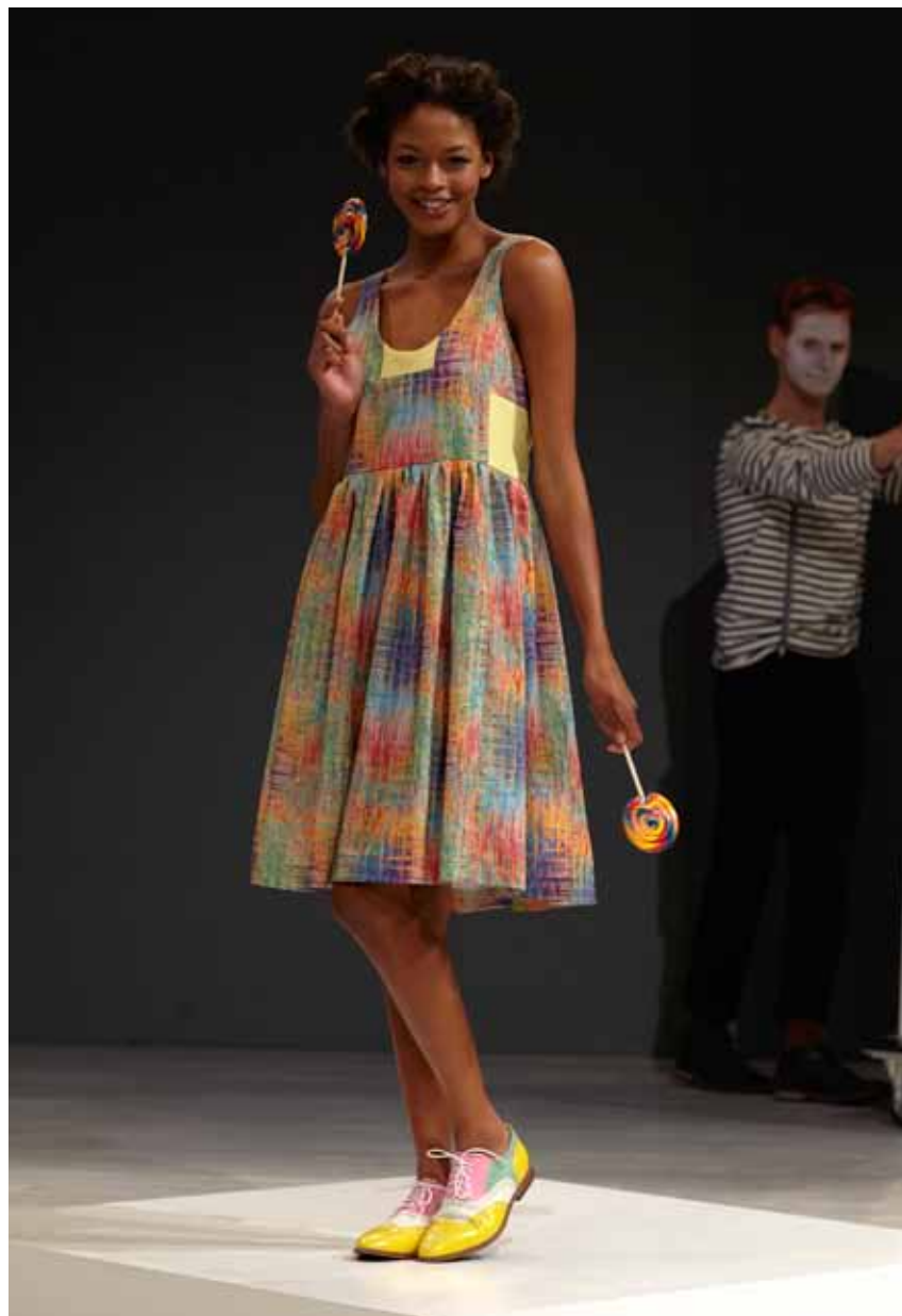
12 ANNETTCHEN TROPICAL